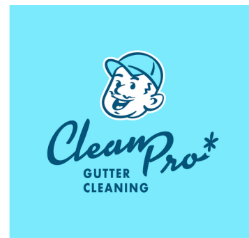
Clean Pro Gutter Cleaning Primary Logo