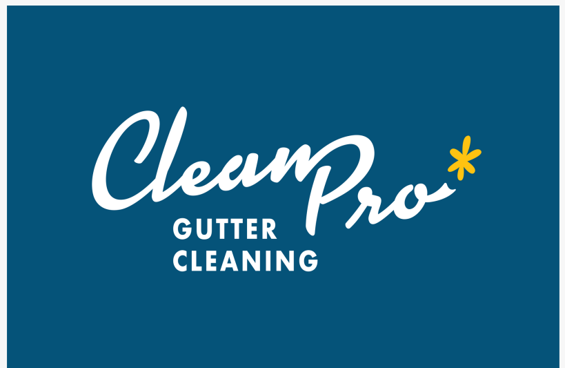
Clean Pro Gutter Cleaning Word Mark