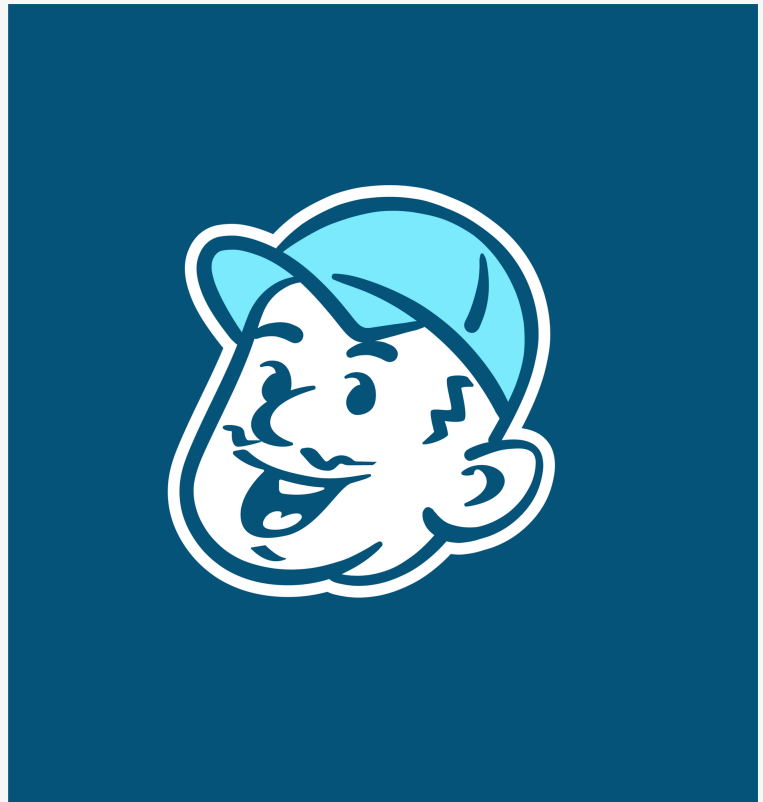
Clean Pro Gutter Cleaning Icon

The tool, available at cleanproguttercleaning.com , calculates a composite risk score for each zip code by combining three federal datasets: 30-year precipitation averages from 15,492 NOAA weather stations, forest canopy density from the U.S. Forest Service Inventory and Analysis program, and freeze-thaw cycle data from the USDA 2023 Plant Hardiness Zone Map. The result is a score from 1.0 to 4.0 that translates directly to how many times per year a homeowner at that address needs their gutters cleaned.