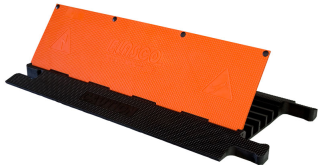
Elasco UG5140 Cable Protector