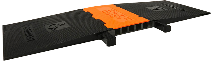
Elasco UG5140 ADA Cable Protector

Driver Industrial Safety™, headquartered in Phoenix, Arizona, is a leading manufacturer of safety