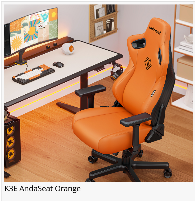
K3E AndaSeat Orange

AndaSeat said the Kaiser 3E was developed with that broader pattern in mind.