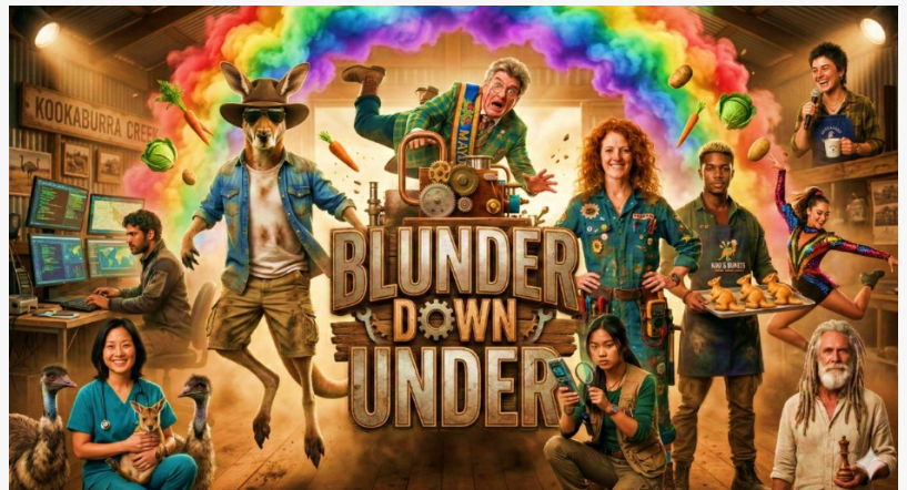
Official movie poster for Blunder Down Under , the Australian-set family comedy treatment from Power Star Entertainment's International Creative THINK TANK, featuring inventor Matilda McSnorkle and her talking kangaroo companion, Jeepers.

Set against the expansive backdrop of the outback, Blunder Down Under blends physical