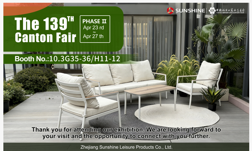
CHINA IMPORT AND EXPORT FAIR