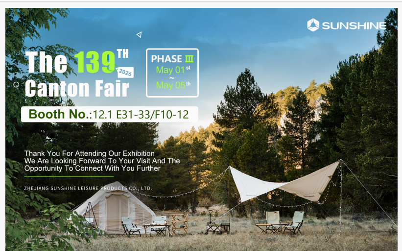
The 139th Canton Fair

The global outdoor furniture market is currently valued at over USD 20 billion and is projected to grow at a compound annual growth rate of approximately 5.5 percent through the end of the decade, according to recent industry analyses. Within this expanding landscape, lightweight