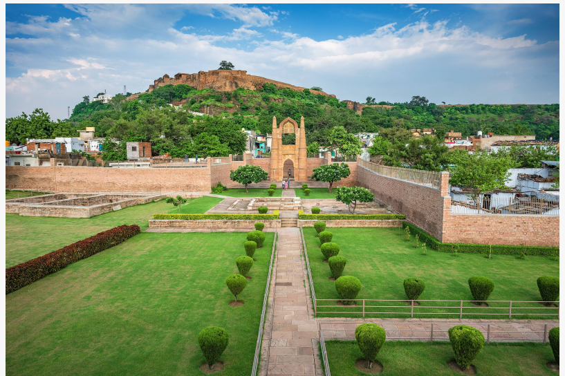
Badal Mahal Gate - The 15th-century ceremonial gateway