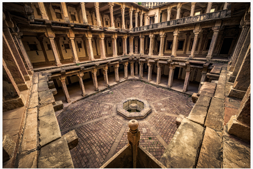
The Raja Rani Mahal - Chanderi

For the Madhya Pradesh Tourism Board, Chanderi represents a