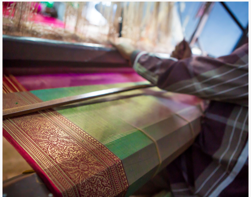
Chanderi Handloom Weaving

Chanderi's handloom tradition defines its identity. The town produces the iconic Chanderi fabric, a handwoven textile celebrated for its sheer texture, lightweight weave, and subtle luster, created through a delicate blend of silk and cotton. Practiced continuously for centuries, this craft remains a vital source of livelihood for a large section of the local population. In 2014,