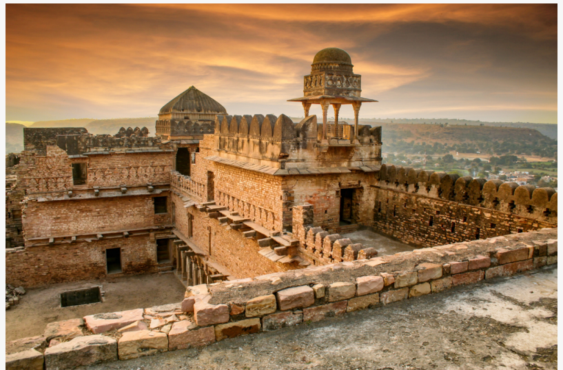
Chanderi Fort - A Legacy in Stone