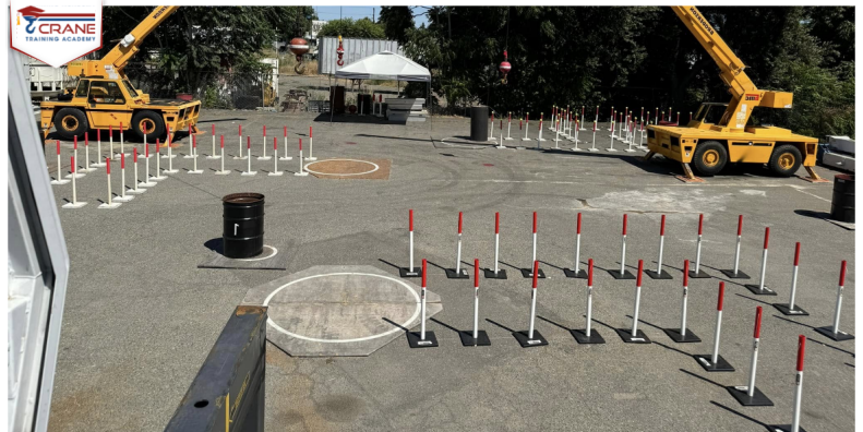
Crane Certification Sacramento CA_

The organization now offers crane operator certification in Sacramento , giving individuals in Northern California access to formal training and testing preparation. These programs support both new learners and experienced operators who need recertification. Participants receive