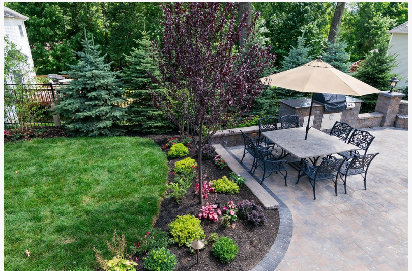
Outdoor Living Services