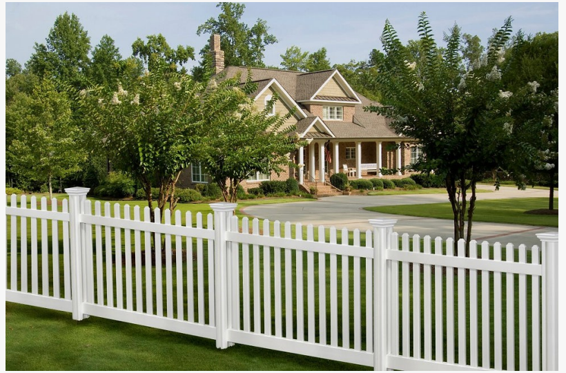
Fence construction services