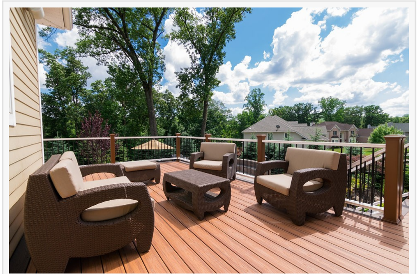
Builds Patios and Decks

□ Masonry Work: Masonry services include the construction and repair of retaining walls, walkways, steps, and other stone or brick structures. These features are designed to provide both functional support and visual appeal.