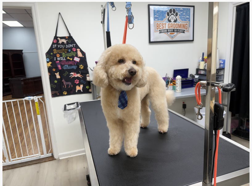
Best Grooming LLC #2