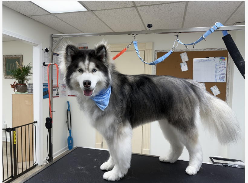
Best Grooming LLC #4