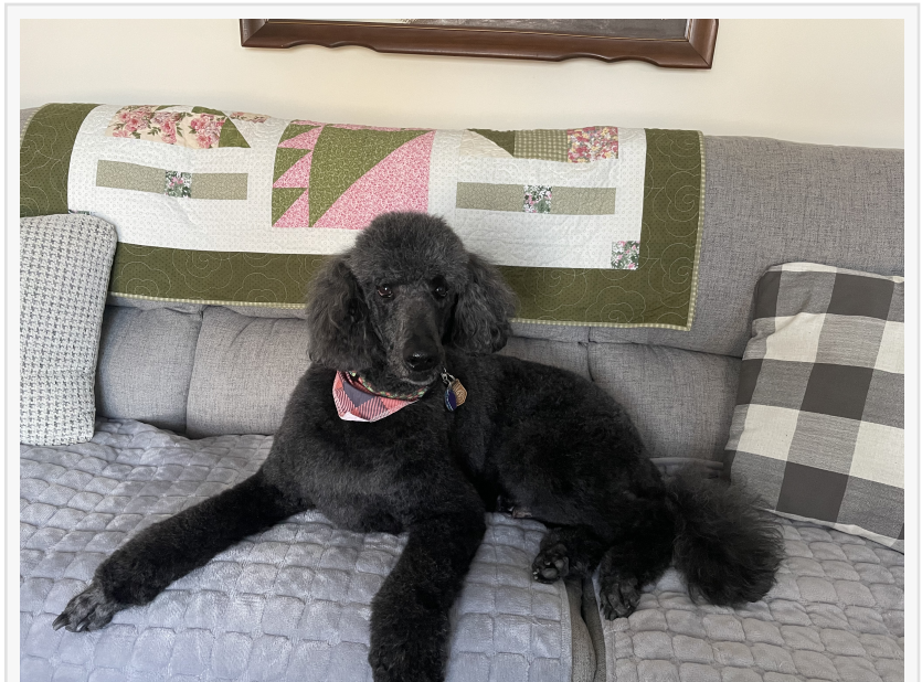
Best Grooming LLC #3