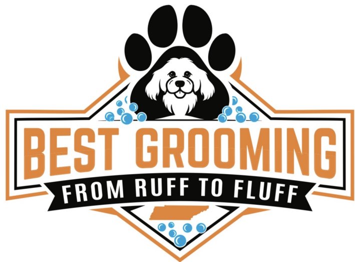
Best Grooming LLC #1

pet's unique needs. With a strong emphasis on safety, cleanliness, and professionalism, Best Grooming creates a calm, stress-free environment where pets can feel comfortable and cared