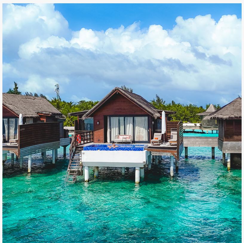
Overwater Reef Pool Villas at Grand Park Kodhipparu provide direct access to the house reef.