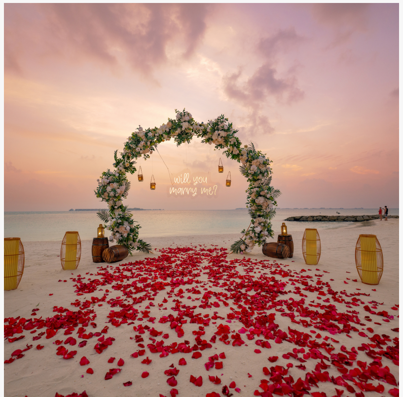
Where moments turn into forever. A sunset, a question, and a memory that lasts a lifetime.