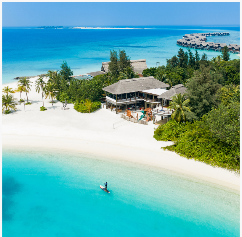
Recreational Beach Club and Lagoon at Grand Park Kodhipparu, Maldives