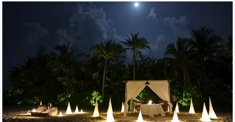
Moonlight Indulgence: Beach Lounge Experience

Set within the Indian Ocean just 20 minutes from Velana International Airport, the award-winning boutique resort transforms the night sky into a guiding force for a sequence of elevated guest experiences. Each lunar phase becomes a distinct chapter, blending wellness, dining, and ocean-based activities into a seamless narrative designed to deepen connection—to self, to others, and to the surrounding environment.