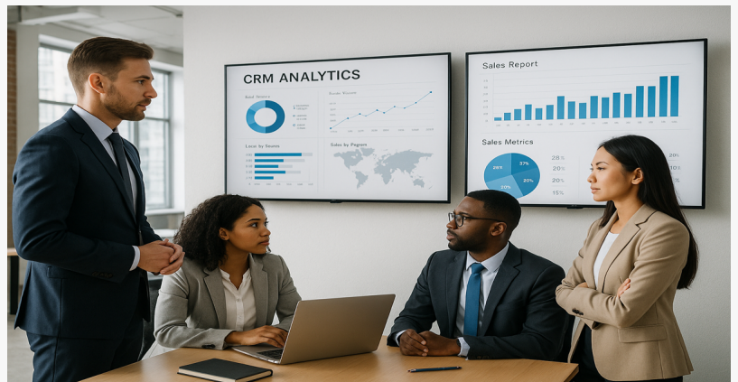
SalesForce CRM sales pipeline dashboard