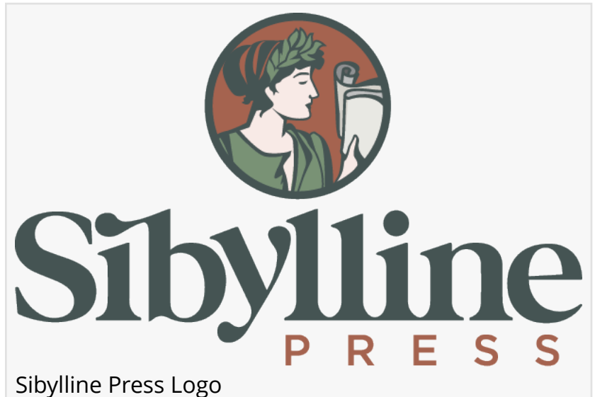
Sibylline Press Logo

What follows is a deeply personal unraveling. With her husband proposing an open marriage as a solution, the couple quickly discovers they have vastly different interpretations of what that means. As tensions rise, their relationship fractures under the weight of betrayal,