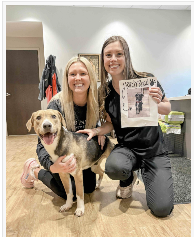
Reed Family Dentistry recently donated more than $1,000 in profits from its 2025 toothbrush and water flosser sales to three Mid-South nonprofits.