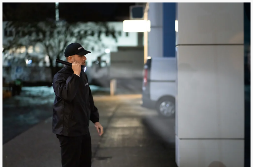
Security Guard Orange County CA

In many settings, security measures are now being considered during the planning and management stages of property operations. Rather than being introduced only after a specific incident occurs, security arrangements are increasingly included as part of routine operational planning. Businesses, property managers, and institutional facilities throughout the county are gradually incorporating trained personnel into their safety frameworks. These personnel may help maintain orderly environments, observe entry and exit points, and support established emergency response