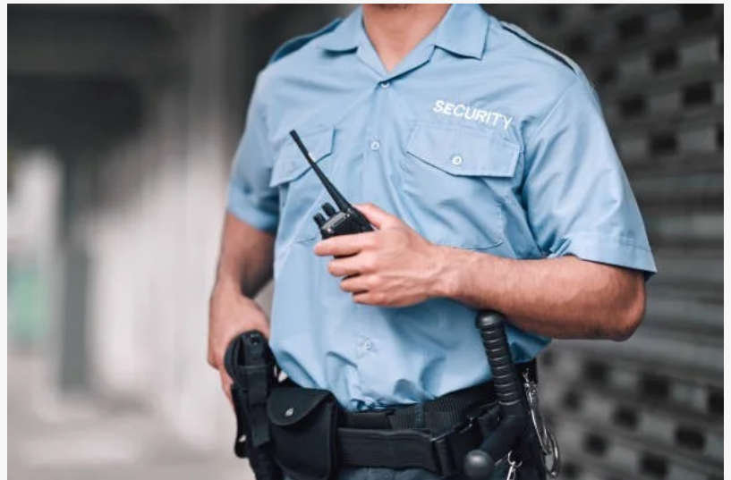
armed security guards