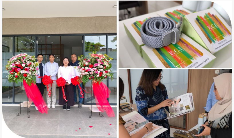
ECI Elastic Team at Opening of Jakarta Plant