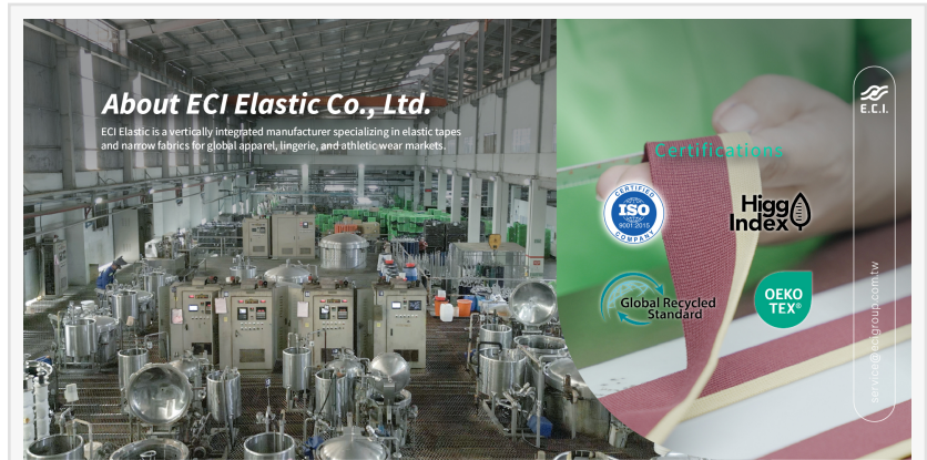
ECI-Certifications: GRS, OEKO, ISO, Higg Index

ECI invites current partners and global brands to explore the enhanced multilingual experience and discover how ECI's digital resources can support their next product development cycle.