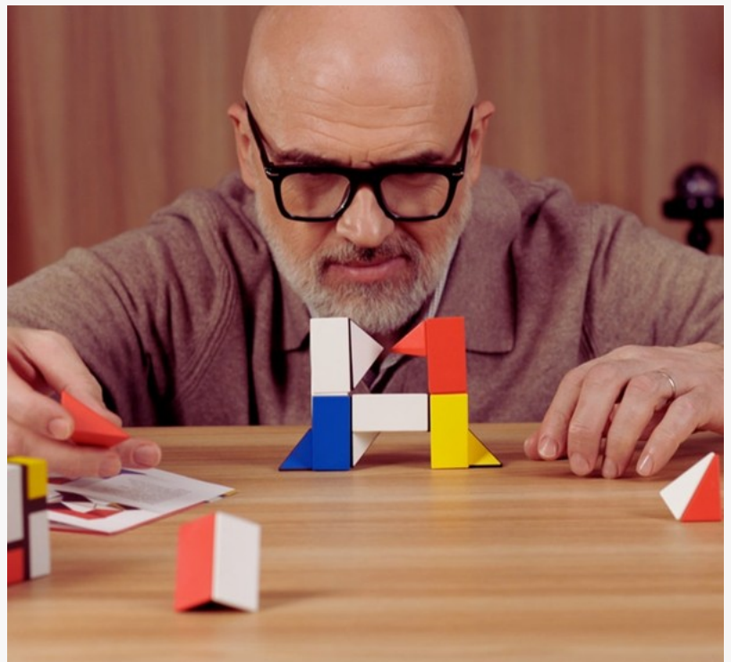
TRIDO - The Style