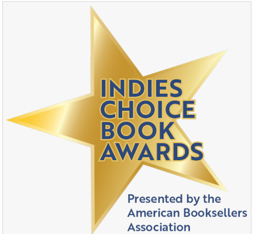
Indies Choice Book Awards logo

"ABA is thrilled to honor the 2026 Indies Choice Book Award winners. These incredible books