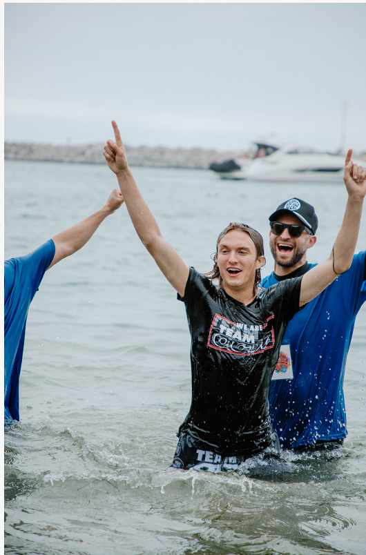
Celebration fills the water at Baptize California 2025 in Huntington Beach as one life is publicly declared changed by faith.

Baptize is a global Great Commission effort focused on uniting the Church to baptize the world. Through regional gatherings and coordinated church participation, Baptize invites churches and individuals to come together in a shared expression of faith through water baptism. The movement's 2026 calendar includes Baptize California at Pirates Cove Beach in Corona del Mar on May 2 and Baptize America and Baptize the World on May 24 through participating churches registered at Baptize.org , along with a livestream from the Museum of the Bible in Washington, D.C.