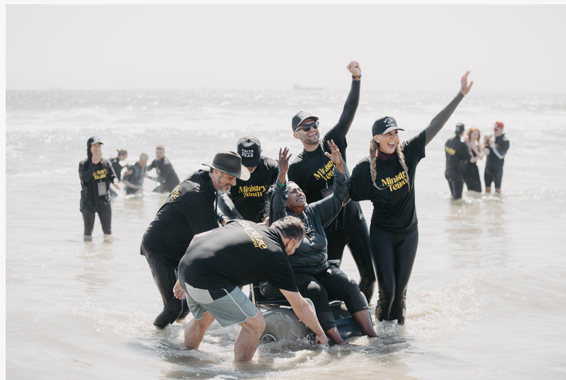
A moving moment of faith at Baptize California 2025 in Huntington Beach as the ministry team helps make baptism accessible for all.