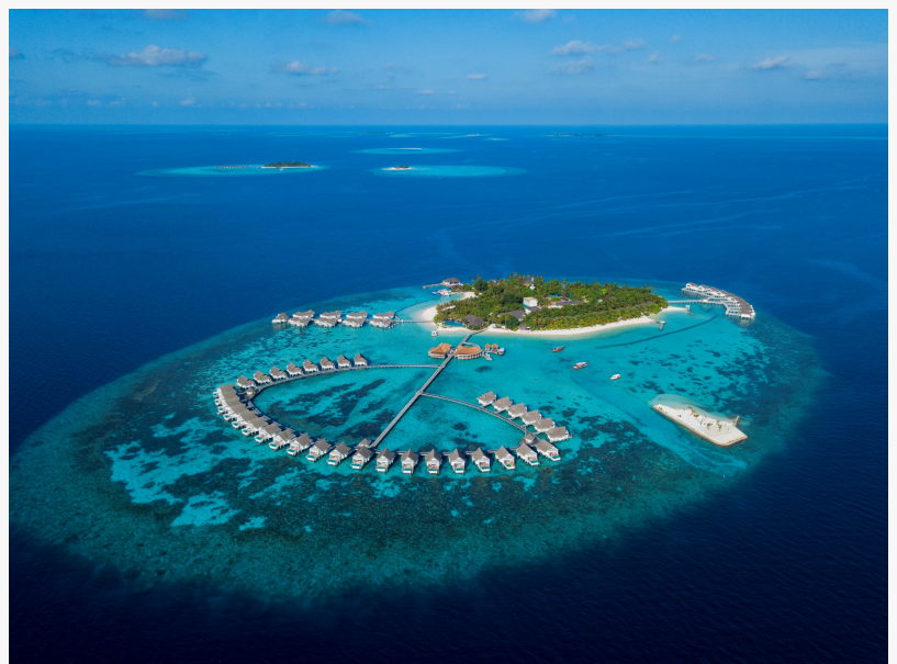
Machchafushi Island Resort & Spa, The Centara Collection

/EINPresswire.com/ -- This April, Centara Hotels & Resorts Maldives invites guests to celebrate the vibrant spirit of Songkran, rooted in its rich Thai heritage, in a setting where turquoise lagoons and white sand shores meet time-honoured traditions. As a brand deeply inspired by Thailand's culture and hospitality, Centara brings the essence of the Thai New Year to its collection of distinctive island resorts, where each celebration reflects authenticity, warmth, and a true sense of togetherness. Across the Maldives, Songkran is thoughtfully reimaged through immersive experiences that honour these traditions while embracing the natural beauty of the islands, creating moments of joy, connection, and celebration. From family-friendly festivities to intimate beachfront gatherings, each resort offers a unique interpretation of Songkran, where water becomes a symbol of renewal and togetherness, and every experience is curated for you and yours.