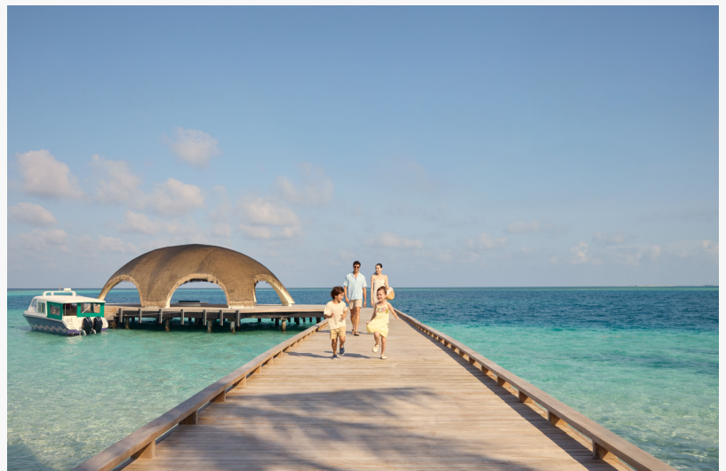
Centara Mirage Lagoon Maldives

At Centara Mirage Lagoon Maldives , nestled within The Atollia by Centara Hotels & Resorts,