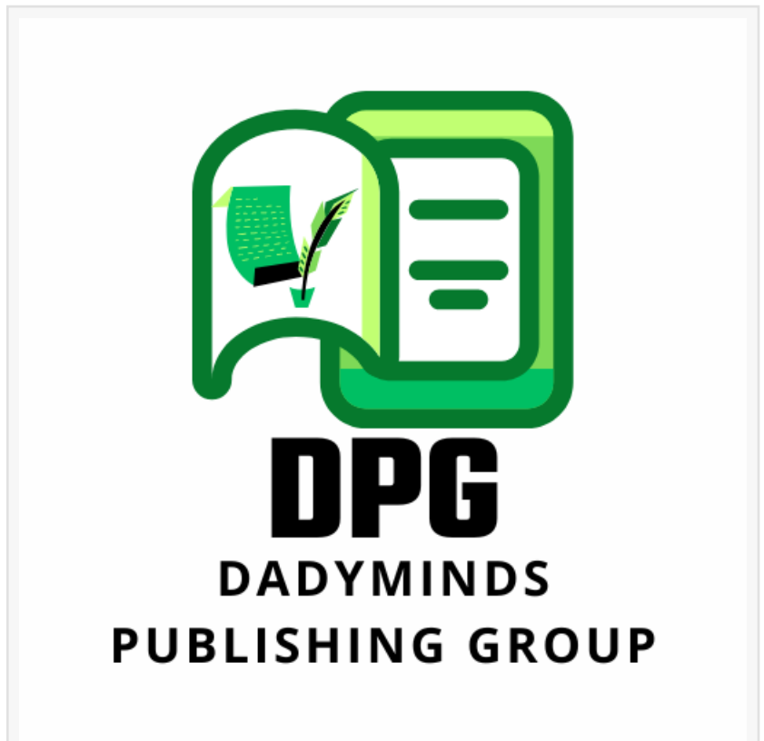
DADYMINDS PUBLISHING GROUP LOGO

A Mission to Preserve Wisdom DADYMINDS is more than a service provider; it is an architect of legacies. In a world saturated with information, DADYMINDS focuses on high-impact literature that transforms lives. Whether you are an academic with a groundbreaking thesis, a professional with a business blueprint, or a poet with a soul-stirring narrative, our infrastructure is designed to treat your manuscript as a valuable asset and a professional landmark.