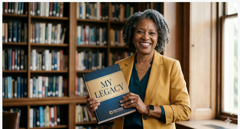
New Author Holding a Book

Unrivalled Value: Transparent Pricing & The April “Legacy” Discount