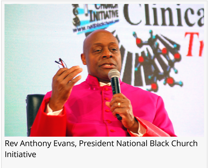
Rev Anthony Evans, President National Black Church Initiative

WASHINGTON, DC, UNITED STATES, April 9, 2026 /EINPresswire.com/ -- The National Black Church Initiative (NBCI) is a coalition of 150,000 African American and Latino faith communities, comprising 27.7 million members, along with the National Clinical Trial Strategic Plan (NCTSP). The American Clinical Health (Disparities Commission (ACHDC), Enroll online Magazine, and NBCI churches launch the African American Parkinson's Patients Advocacy Organization (AAPPAO) to educate, provide critical information on care, and offer opportunities to enroll in clinical trials