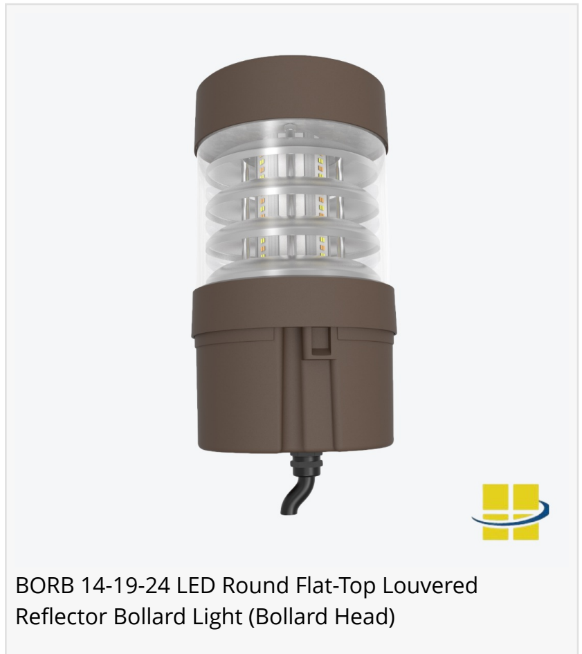
BORB 14-19-24 LED Round Flat-Top Louvered Reflector Bollard Light (Bollard Head)

Long-Life Performance: Rated for 50,000 hours of life and backed by a 5-year limited warranty, the BORB operates reliably in extreme temperatures ranging from -40°F to 113°F.