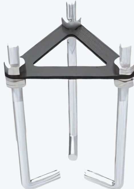
CYLINDER HOUSING GROUND ANCHORS

BORB 14-19-24 LED Round Flat-Top Louvered Reflector Bollard Light (Tuning Switches)