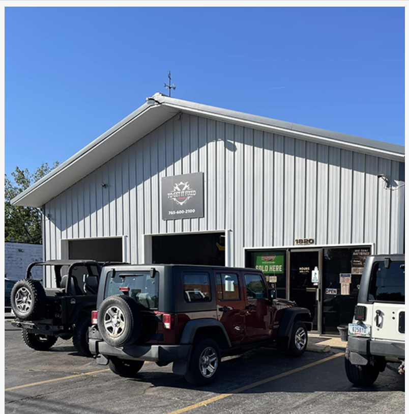
To get it fixed, LLC

This press release can be viewed online at: https://www.einpresswire.com/article/904824552