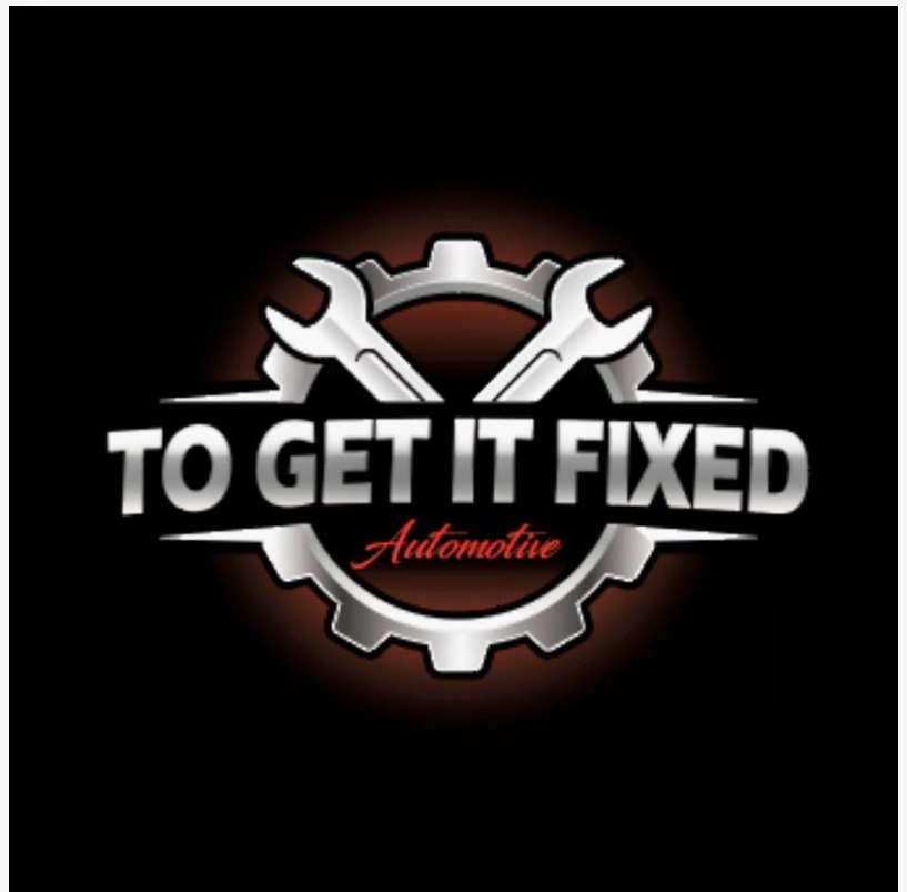
To get it fixed, LLC logo