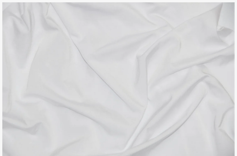
Nylon Spandex 4 Way Stretch Fabric..