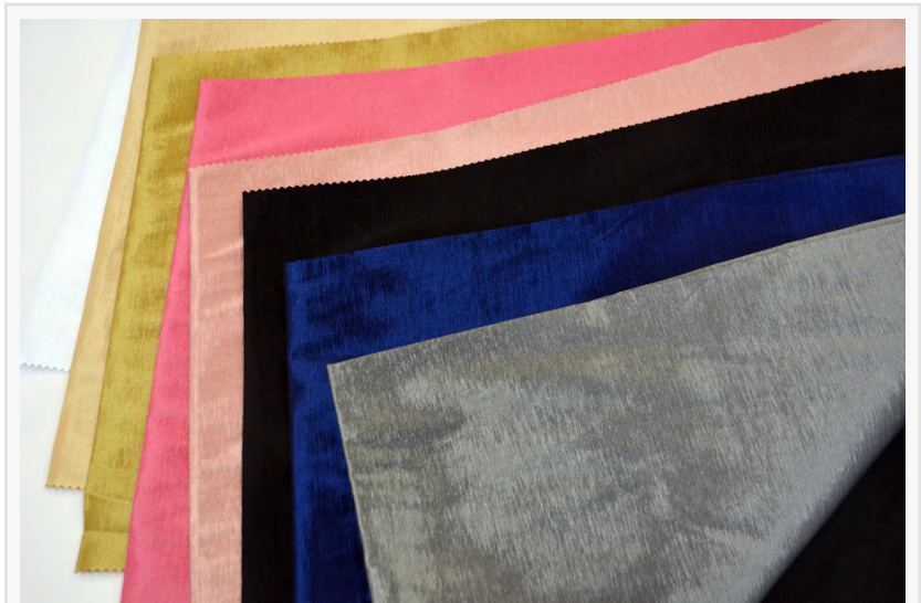
Stretch Taffeta Fabric..

The expanded range includes materials designed to meet varying performance requirements. Some fabrics are suited for structured uses, offering stability and resilience, while others emphasize softness and movement. This variation allows designers to select materials that align