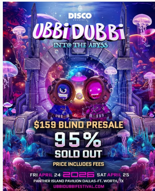
ubbi dubbi festival discount promo code 2026 discount code