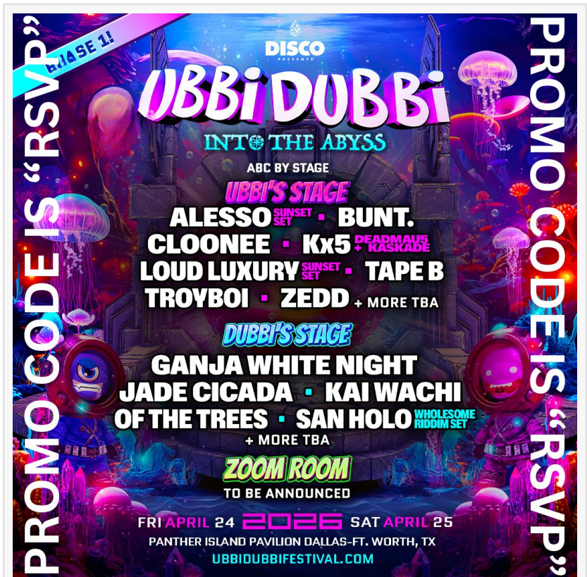
biggest discount code for Ubbi Dubbi is "RSVP"

https://LimoHive.com is launching a new affiliate program designed to help festivals, promoters, venues, and event-focused partners capture more value from transportation demand at a time when industry margins are under pressure. By becoming a LimoHive partner, qualified affiliates can refer attendees and groups in need of transportation, earn