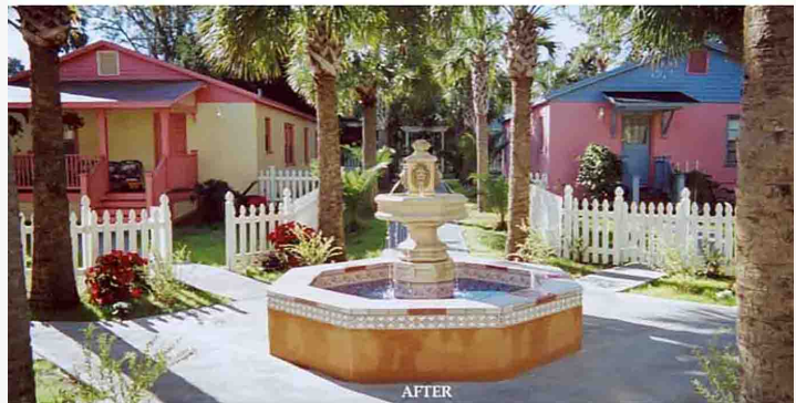
Arth turned a drug slum into The Garden District as a living laboratory of urban renewal