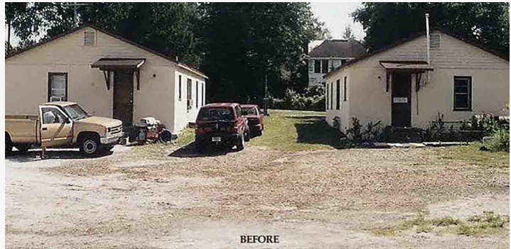
Before: Cracktown housing with treeless parking and a dumpster. After: Garden District courtyard with a fountain and pedestrian lanes