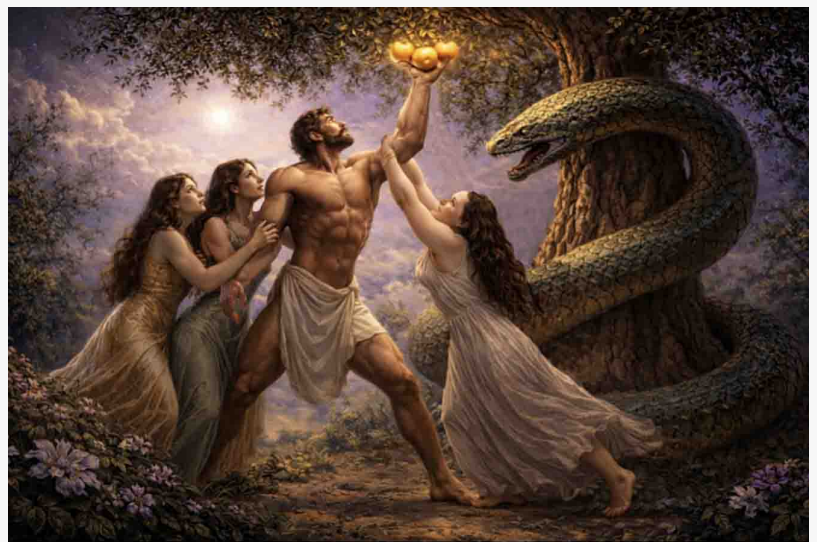
Hercules reaches for forbidden fruit, representing knowledge, beneath a sacred tree, guarded by a female trinity and a serpent. The golden apples are in a paradisiacal garden where belief survives by keeping truth inaccessible.

Michael E. Arth Golden Apples Media mea@michaearth.com