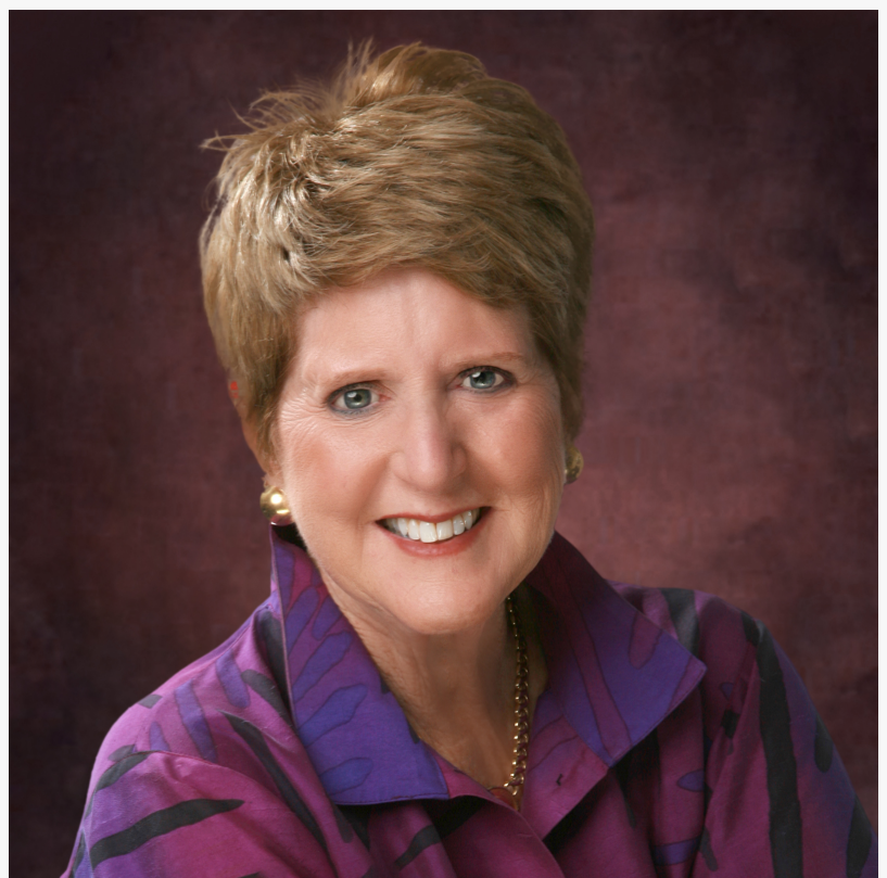
Dr. Lois Frankel is an executive coach, keynote speaker and bestselling author of the “nice girls” series.

Written in a conversational tone short on unnecessary theory and long on actionable tips, Nice Girls Don't Get the Corner Office addresses today's cultural shifts that impact women at work — including the Me Too movement, gender fluidity, the shift to remote work, the dismantling of DEI programs and the erosion of women's reproductive rights, to name a few — leaving women with clear guidance on identifying and overcoming today's most pressing challenges.