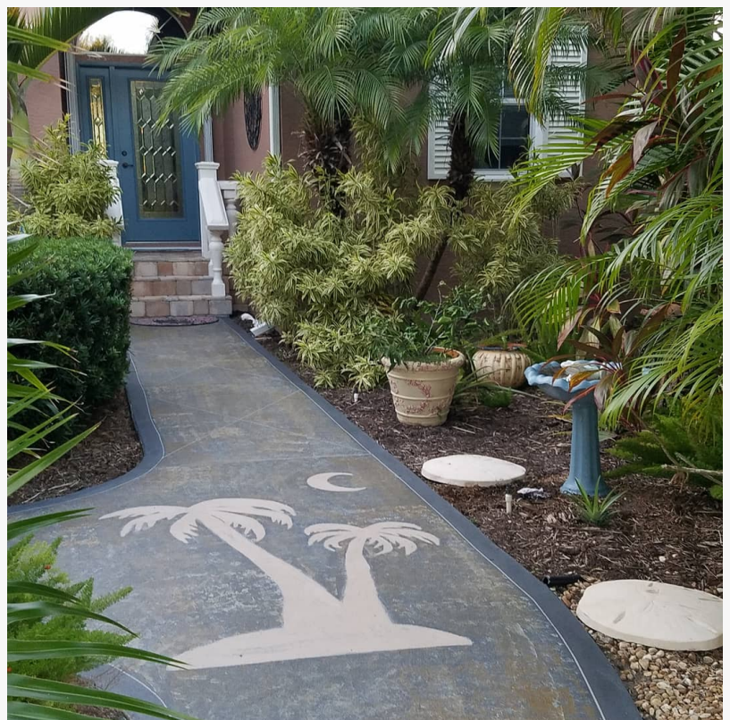
Adding unique curb appeal with stenciled SpreadStone Decorative Stone Coating makes a first-class appearance for this Florida home.

Give sidewalks and walkways the look of tile or natural stone with the SpreadStone™ Decorative Concrete Resurfacing Kit. This all-in-one kit includes a specialized applicator for stunning