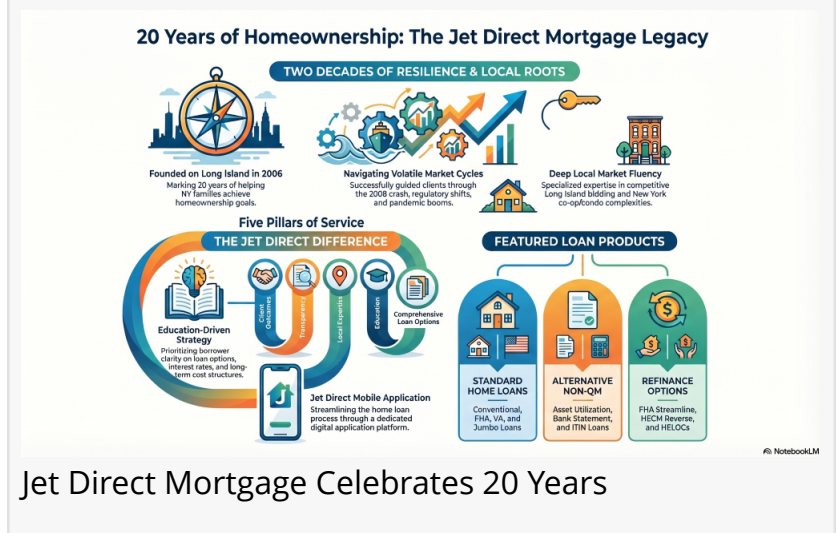
Jet Direct Mortgage Celebrates 20 Years