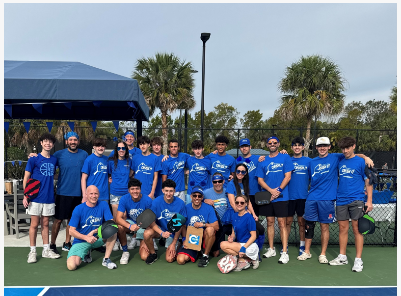
Crush Colon Cancer Pickleball Tournament