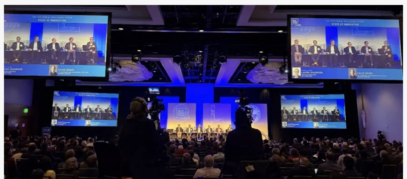
The WuXi Global Forum

WuXi AppTec addresses these challenges by leveraging its deep industry insight, long-standing relationships, and global engagement initiatives. Through structured platforms, cross-sector collaboration, and active community involvement, the company helps connect stakeholders, align perspectives, and enable more effective collaboration across the global life sciences