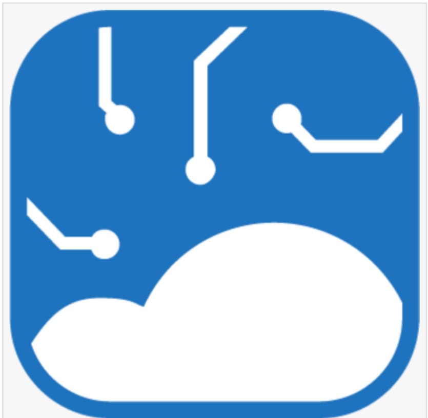
BigMind 2.0 by Genie9 — Intelligent Cloud Backup for Business

WhatsApp access is strictly read-only at the system level. The AI cannot delete, modify, or create data through WhatsApp, even if asked. Account linking uses a one-time code generated from the web dashboard, every interaction is audit-logged, and