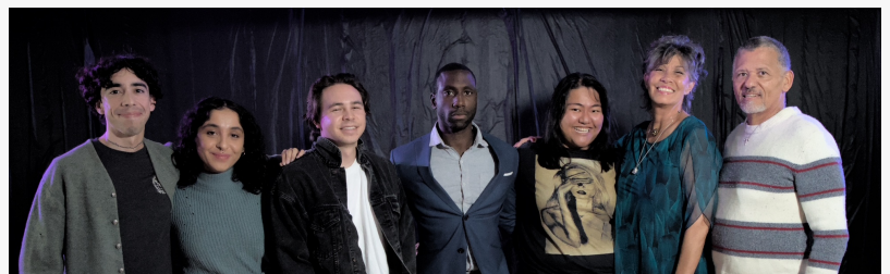
VERSIFIED! The Human Equation, Cast