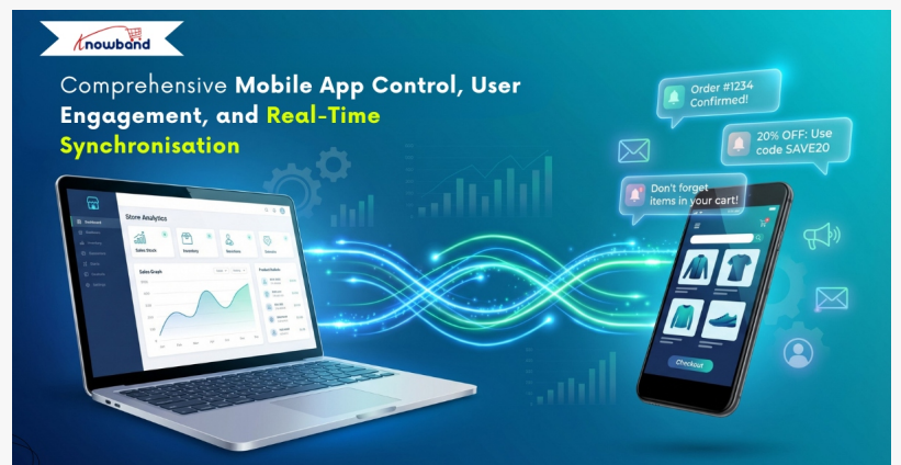
Knowband's app creator offers full control, higher engagement, and real-time sync.