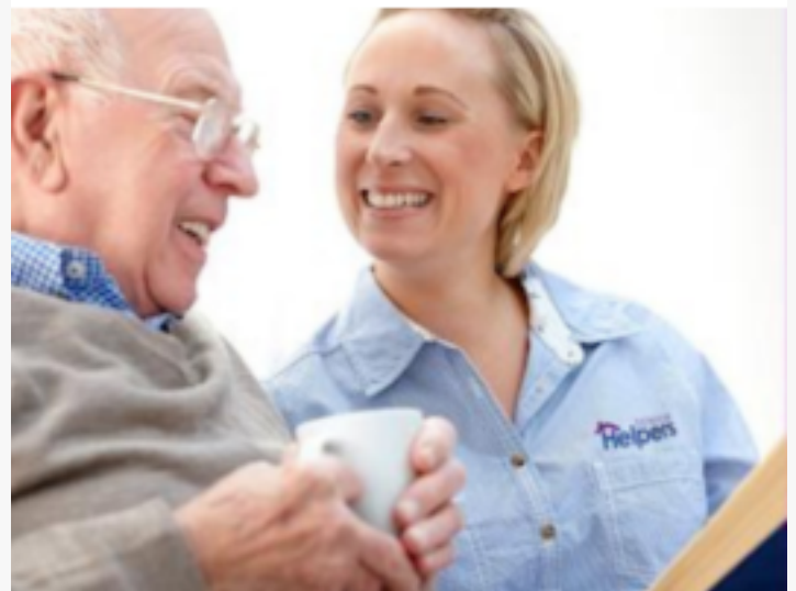
Caregiver at Senior Helpers