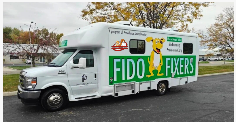
Planned PETHood's FIDO Mobile Spay Neuter Vehicle