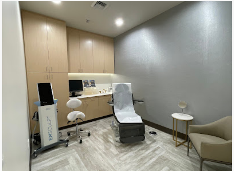
Tseng Plastic Surgery Office in Bellevue