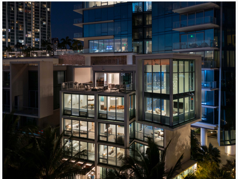
Private Five-Level Villa with Pool at Waiea, Honolulu's Finest Address

Backed by the world's leading luxury real estate auction platform, the division combines decades of experience driving sales for high-profile projects with unmatched reach across a global network