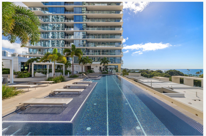
Drive-In Garage, White-Glove Concierge, and Full Building Amenities

Waiea residents enjoy concierge service, an attended lobby, and 24-hour security. Resort-style amenities include a community pool, spa and sauna, state-of-the-art fitness center, clubhouse and conference spaces, barbecue and outdoor patio areas, dog park, and playground.