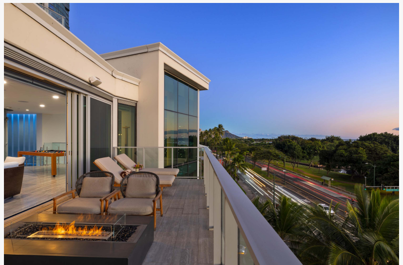
Sweeping Ocean and Skyline Views Across Every Level