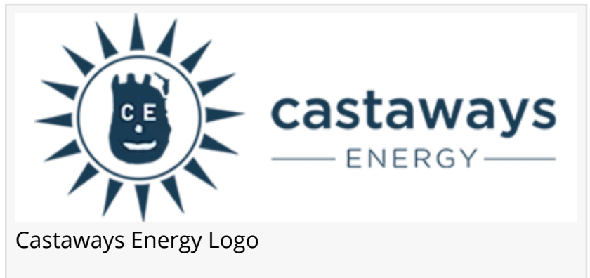
Castaways Energy Logo

ORLANDO, FL, UNITED STATES, April 15, 2026 /EINPresswire.com/ -- Castaways Energy, a trusted Central Florida solar provider , was recently featured in a Spectrum News 13 segment examining the rapid growth of utility-scale solar across Florida—and why those large projects are not translating into meaningful savings for residential customers.