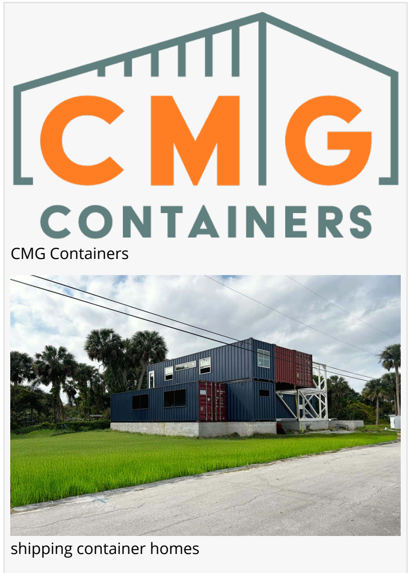
shipping container homes

CMG Containers supports container homes by providing units that serve as a reliable