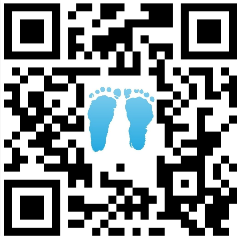
Maverick's Legacy QR