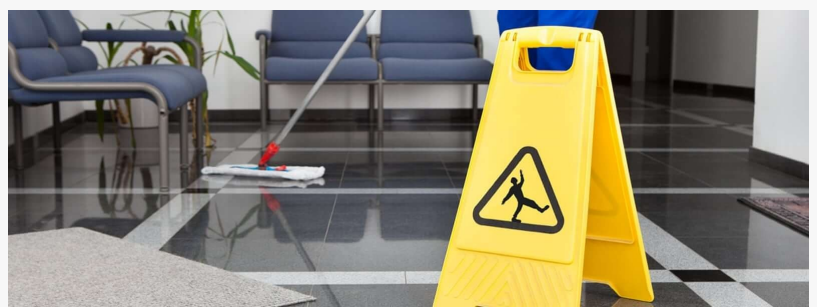
office cleaning services

KING OF PRUSSIA, PA, UNITED STATES, April 17, 2026 /EINPresswire.com/ -- Green Bee ProClean, a cleaning service provider based in King of Prussia, Pennsylvania, has introduced a referral program aimed at formalizing how new clients are connected to its services through existing customer networks. The initiative outlines a process for recognizing referrals while maintaining the company's ongoing residential and commercial cleaning operations in the region.