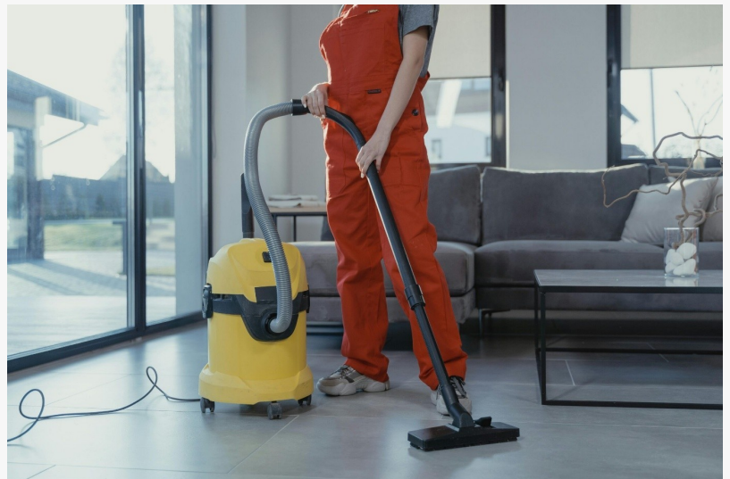
Residential cleaning services