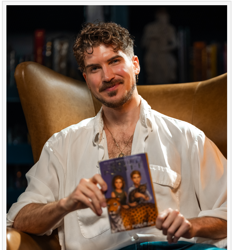
Joey Graceffa and the Book That Changed His Life

This press release can be viewed online at: https://www.einpresswire.com/article/906144884