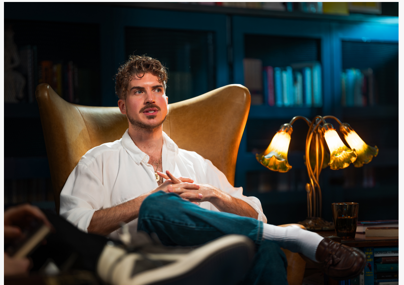
Joey Graceffa Discusses The Subtle Knife