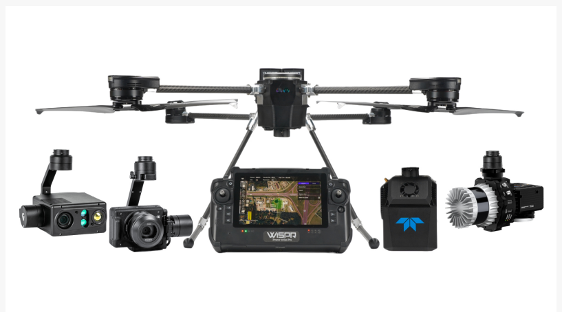
WISPR Systems' SkyScout 2+