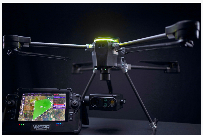
WISPR Systems' SkyScout 2+

WISPR Systems designs and manufactures American-made drone technology built for secure, reliable operations across federal, public safety, infrastructure, energy, transportation, and