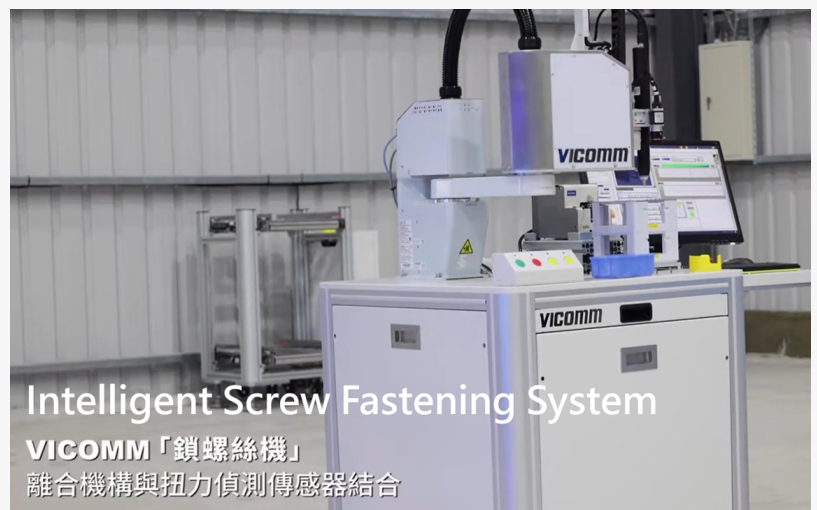
Intelligent Screw Fastening System VICOMM「鎖螺絲機」 離合機構與扭力偵測傳感器結合 Vicomm Intelligent Screw Fastening System integrates robotics, torque sensing, and machine vision to deliver high-precision, automated assembly with real-time process monitoring

“Manufacturers need solutions that deliver both efficiency and reliability,” said a spokesperson for Vicomm Technology. “Our system combines automation with real-time data to help customers achieve smarter and more consistent production.”