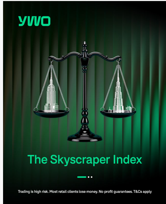
Welcome to YWO