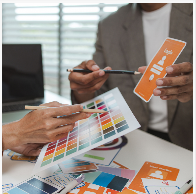
Logo Design Dallas

As a dedicated provider of Dallas logo design services, the agency's structured workflow encompasses several distinct operational phases: