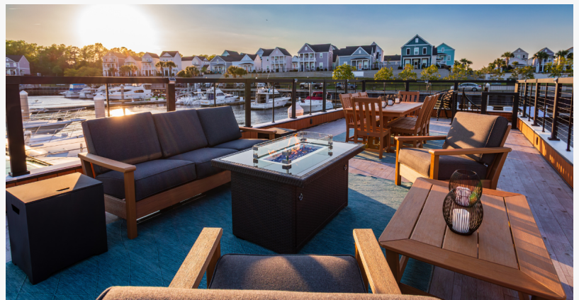
Luxury Houseboat Rooftop with 360 Views