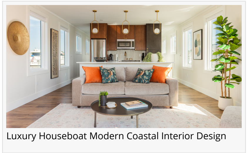
Luxury Houseboat Modern Coastal Interior Design