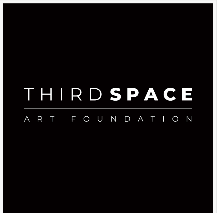
Logo for Third Space Art Foundation

1922 Revisited is developed in dialogue with the curatorial framework of the 2026 Biennale. Its theme, In Minor Keys, emphasizes attention to affective, sensory, and interpretive dimensions of artistic experience, creating space for reflection, listening, and encounter.