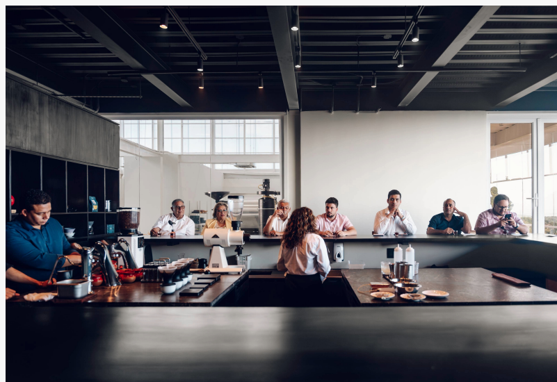
Spirit Origin's Coffee Omakase experience in Roatán, Honduras — an intimate, origin-driven tasting featuring Honduras' top Cup of Excellence coffees in a purpose-built omakase bar overlooking the Caribbean.