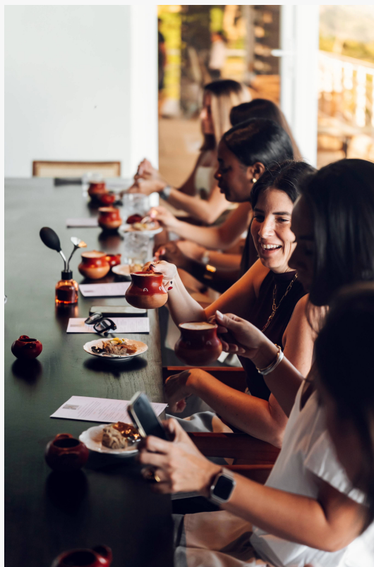
Guests enjoying a Coffee Omakase experience at Spirit Origin in Roatán, Honduras, where specialty coffee is served through a guided tasting at origin

LinkedIn Instagram Facebook YouTube Other